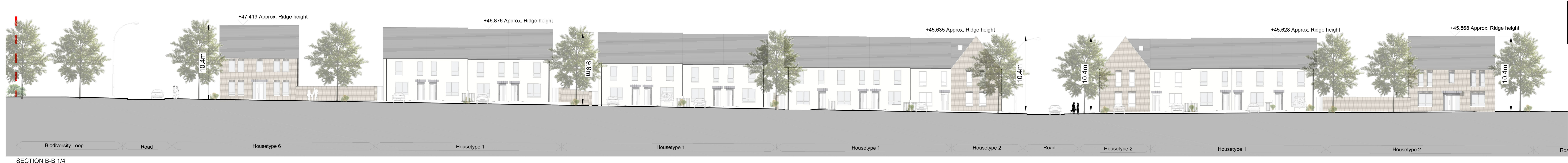
SECTION B-B 1/4