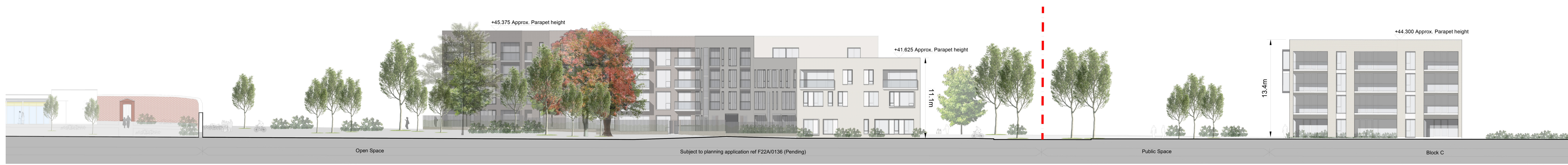
SECTION B-B Continued 4/4

This drawing is copyright. 1. Do not scale this drawing. 2. Errors and omissions to be immediately notified to the Architect. 3. All dimensions to be checked on site.